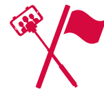
POLES OR STICKS (INCLUDING SELFIE-STICKS)