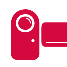
VIDEO RECORDING EQUIPMENT